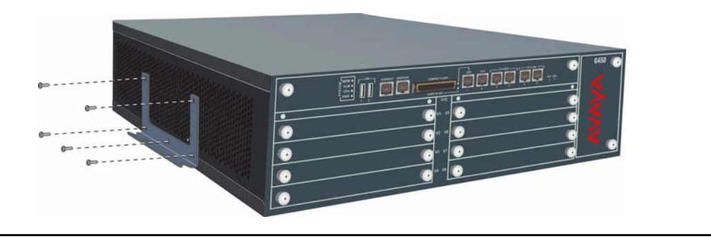
Figure 4: Wall mounting bracket placement