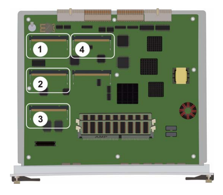
Figure 9: Location of MP20 and MP80 modules