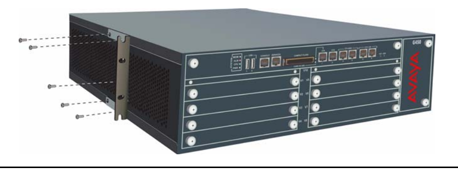
Figure 3: Attaching a mounting bracket with cable guides