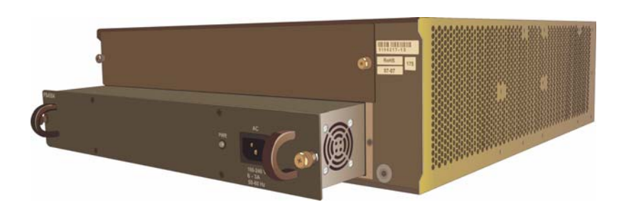
Figure 11: Inserting a power supply unit

The G450 provides full redundant, load sharing power supply units (1 + 1). A single power supply unit provides sufficient power for any G450 configuration. If you choose to install two power supply units, they operate in a load sharing mode.