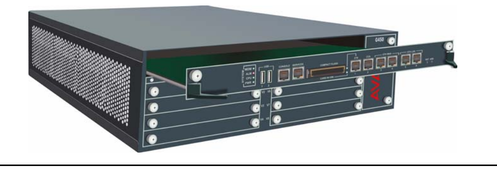
Figure 8: Removing and inserting the G450 main board