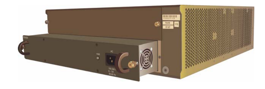
Figure 5: Inserting the power supply unit