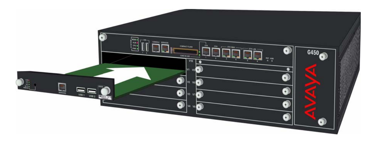
Figure 7: Inserting the S8300 Server module.